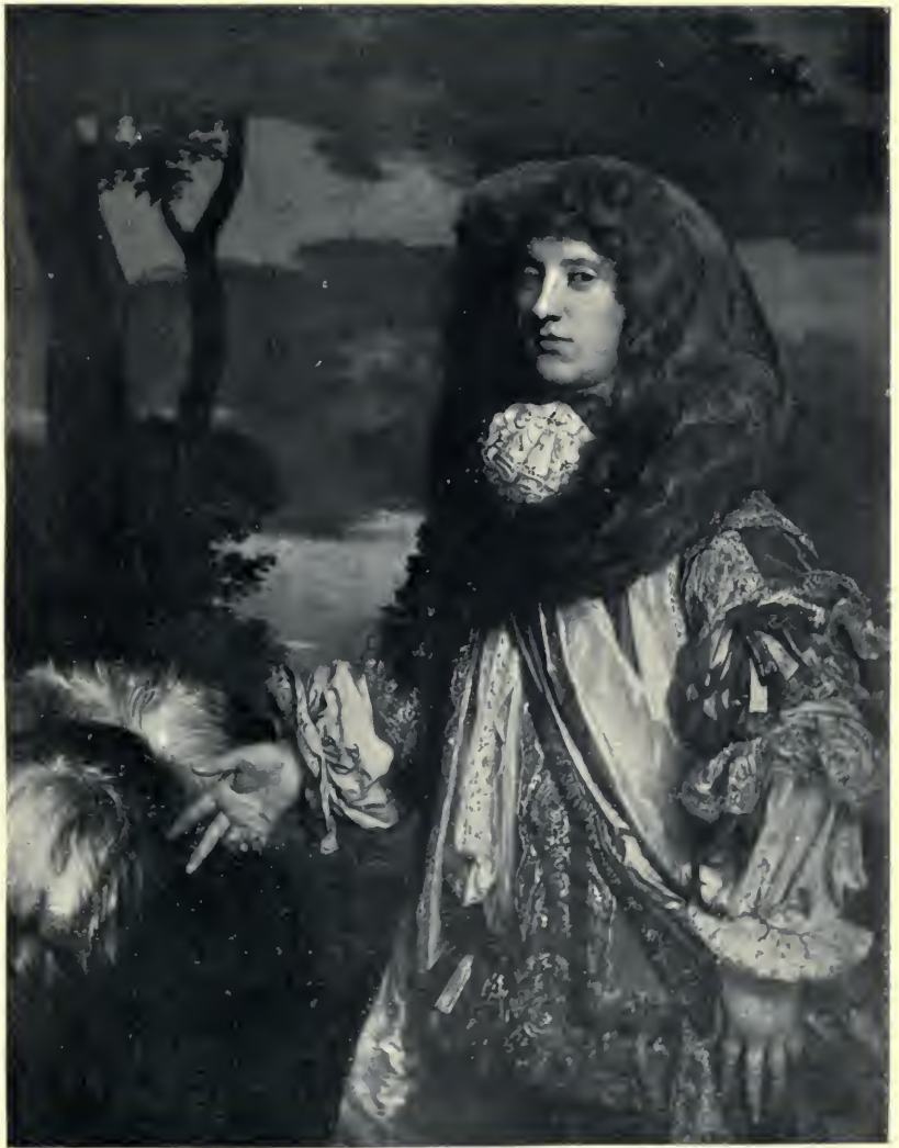
JOHN HAY Second Marquis of Tweeddale